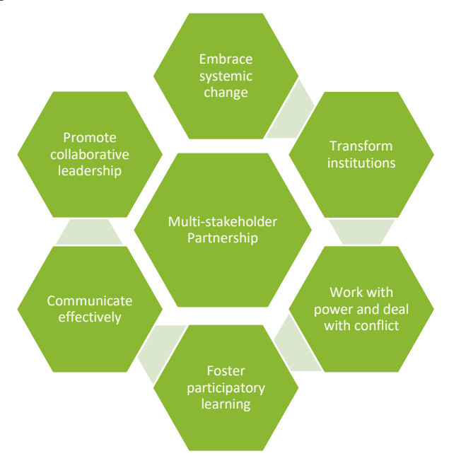
Figure 1 Features of a successful MSP

There is also a possibility to engage private institutions in the management of protected areas. This was the <u>case</u> when a local Cooperative in Molise, Italy was created for the management of tourist activities, logistics and administration of a protected territory. This is a positive example of collaboration between two municipalities, universities and WWF in establishing and managing a nature reserve.