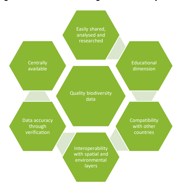
Figure 2 Characteristics of good biodiversity data

Compatibility of biodiversity data across countries is an important feature allowing users to compare and share data globally. Data integration with other sectors is also possible.