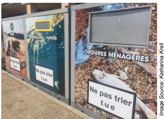
'Not separating kills' – Cigarette pack style warning on waste collection containers in Southern France

Well-designed communication and awarenessraising campaigns can have a substantial impact on separate collection as the <u>LIFE KNOW</u> <u>WASTE</u> project demonstrated in Cyprus. Following the awareness-raising project, an increased percentage of the population indicated to have changed behaviour towards more reuse and recycling. Indeed, the recycling rate in Cyprus had increased from 44% (2013) to 59% in 2017. Another study in Catalonia also attributed a probable uplift (17.9%) in separate collection to awareness campaigns.<sup>6</sup>