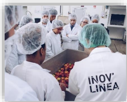
University Leiria Polytechnic Institute 9%

CONTACTS (total): 75 SERVICES (total): 31 CLIENTS (total): 23