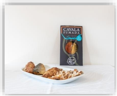
Start Up Fumeiro do Mar 52%