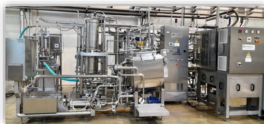
OHMIC HEATING PLANT