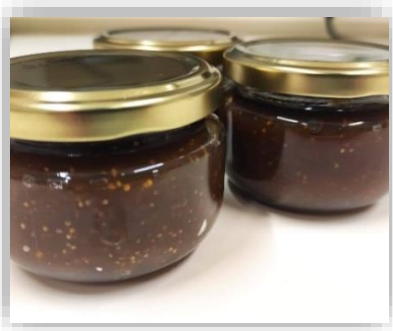
SME Quinta da Mó 39%