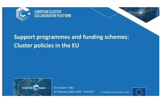
Accelerate GDT @ ECCP Webinar

The Piedmont Region hosted its annual event on the European Regional Development Fund Regional Programme for the 2021-2027 period, with a key focus on the next phases of development of the regional cluster model and its future challenges. <u>Read More...</u>