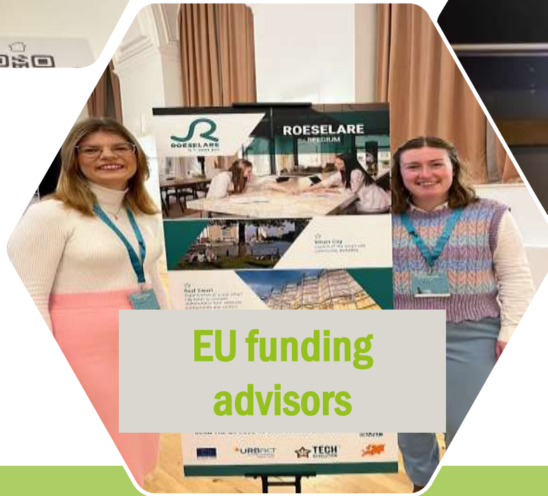
EU funding advisors