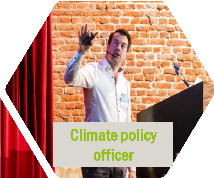
Climate policy officer