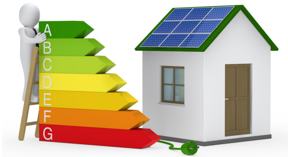
Designed by Freepik