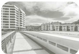
Municipal public innovation