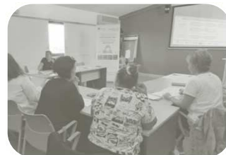
Job opportunities for disadvantaged groups