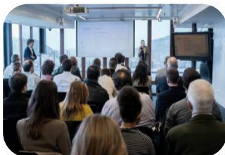
Innovative entrepreneurship hub