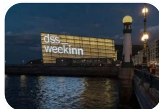
Science city and innovation platform