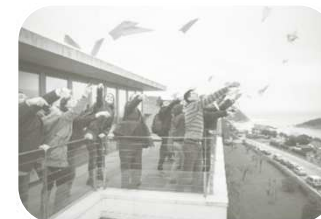
Local young talent