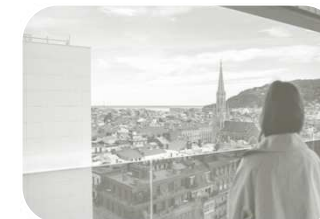
International innovation hub