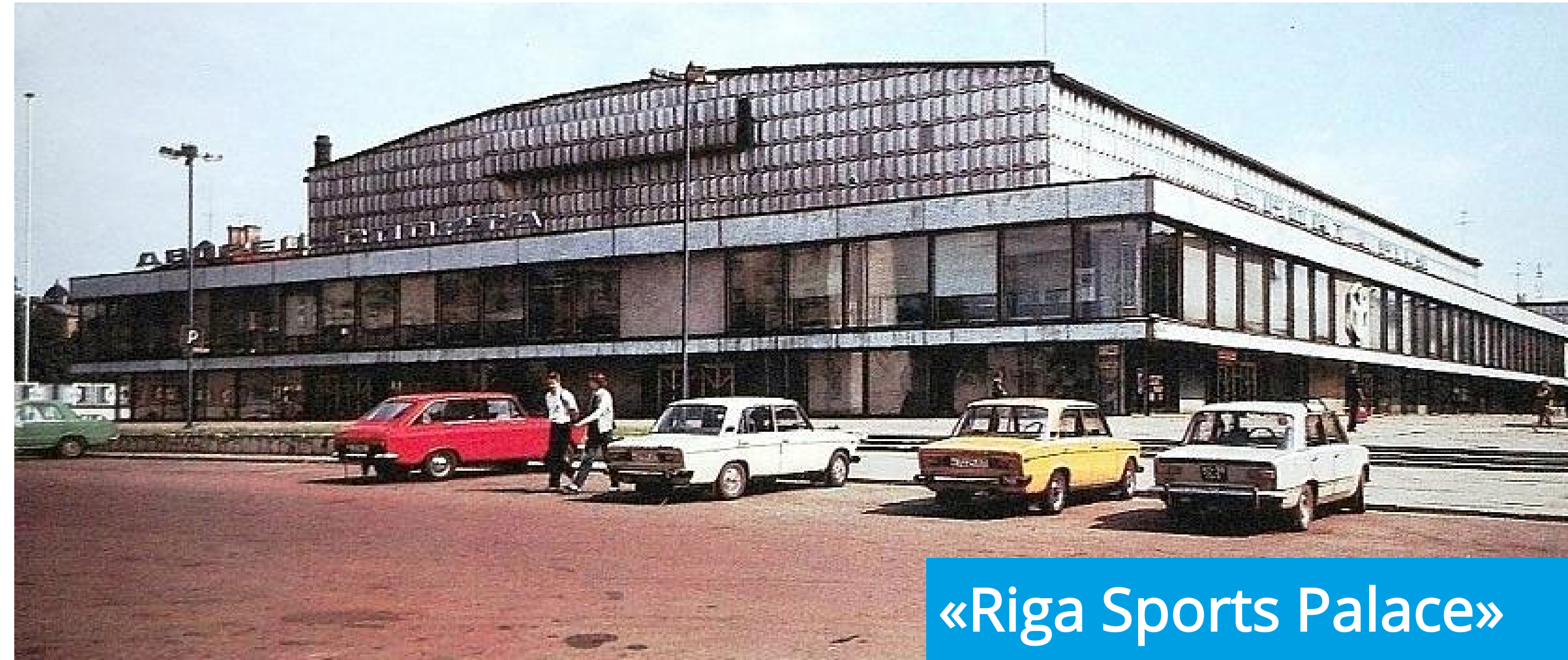
«Riga Sports Palace»