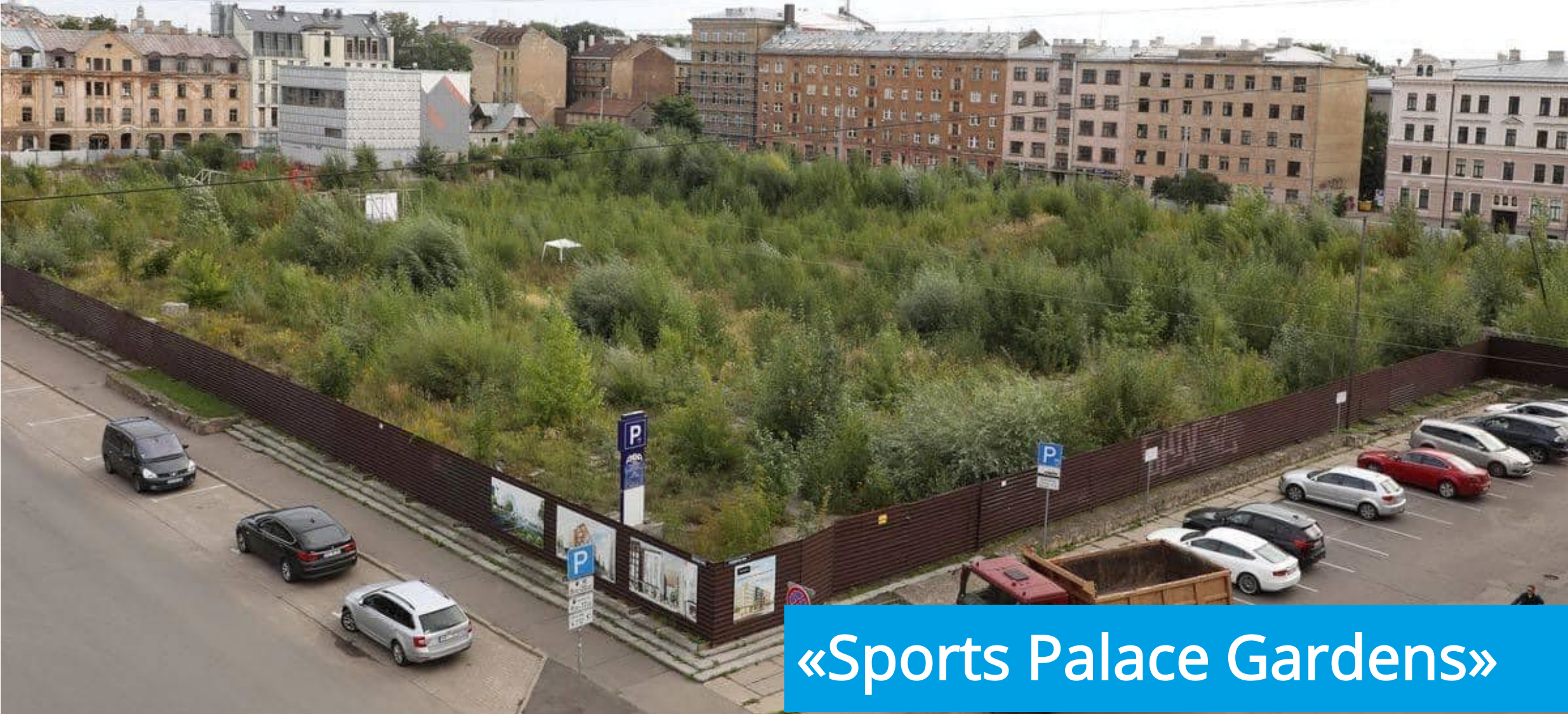
«Sports Palace Gardens»