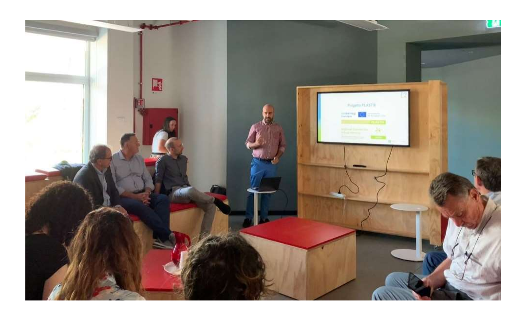
Figure 1. AFIL's Strategic Community on Advanced Polymers at ROLD in July 2023

ROLD is a company based in Nerviano, in the province of Milan, which has been producing innovative and technological components for household appliances for over sixty years. It has 230 employees and a turnover of 40 million Euros. Among its clients, there are major players of the so-called "White Goods" industry, such as Whirlpool, LG, Bosch and Electrolux. ROLD's products include innovative locking systems, smart sensors, modular encoders, microswitches and push-push switches.