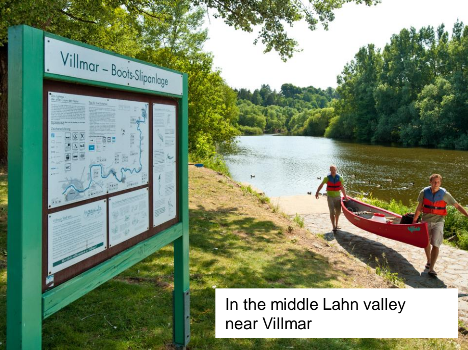
In the middle Lahn valley near Villmar