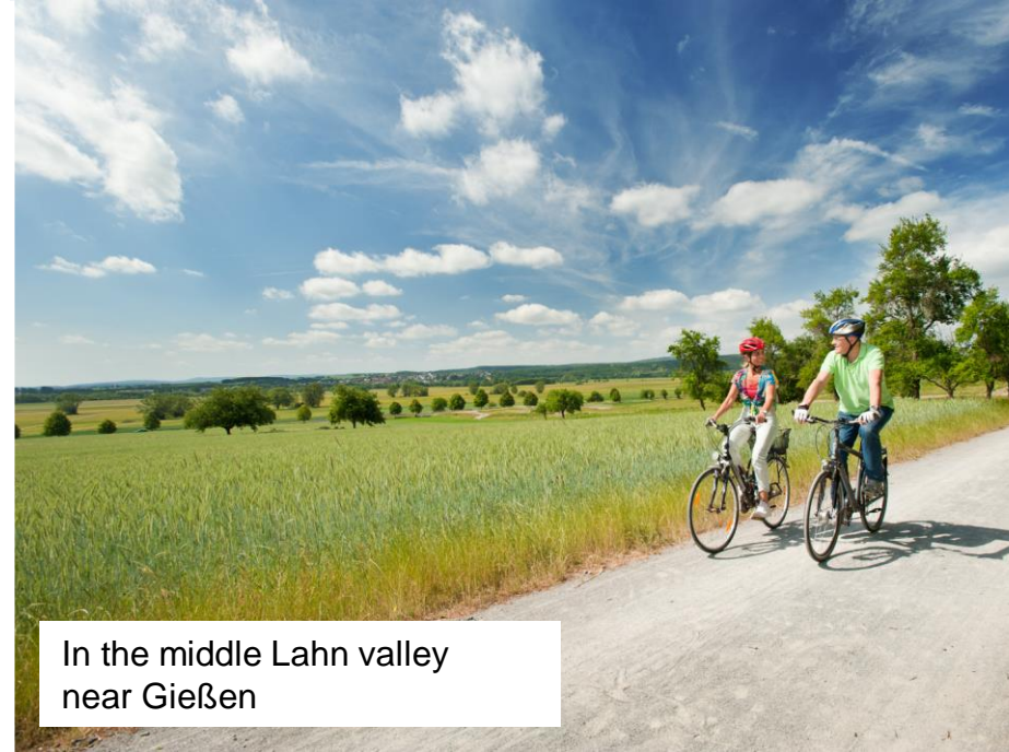
In the middle Lahn valley near Gießen