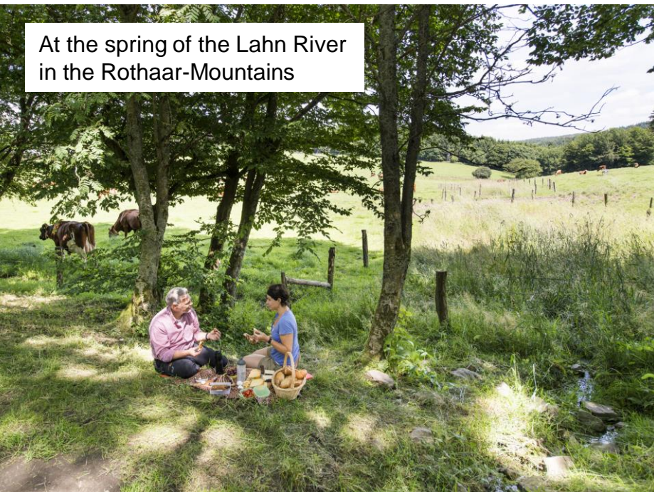
At the spring of the Lahn River in the Rothaar-Mountains