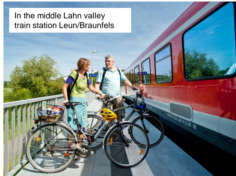
In the middle Lahn valley train station Leun/Braunfels